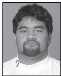
Defensive Tackle Haloti Ngata