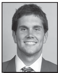
Quarterback Matt Leinart